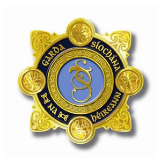
Keep vigilant, look out for persons acting suspiciously