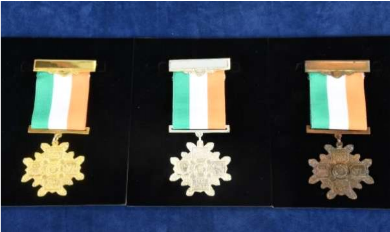
Pictured Above is Example of a Gold, Silver and bronze Scott Medal

The medal is in the form of a Celtic cross. There are five panels on the face of the medal that depict the words "The Scott Medal", "For Valour", the eagle and the shield of the USA, the harp and sunburst and the Garda Crest. The reverse of the medal carries the inscription, "Garda Síochána na h-Éireann". The 4 outside panels are the arms of the four provinces of Ireland - Ulster, Munster, Leinster and Connaught.