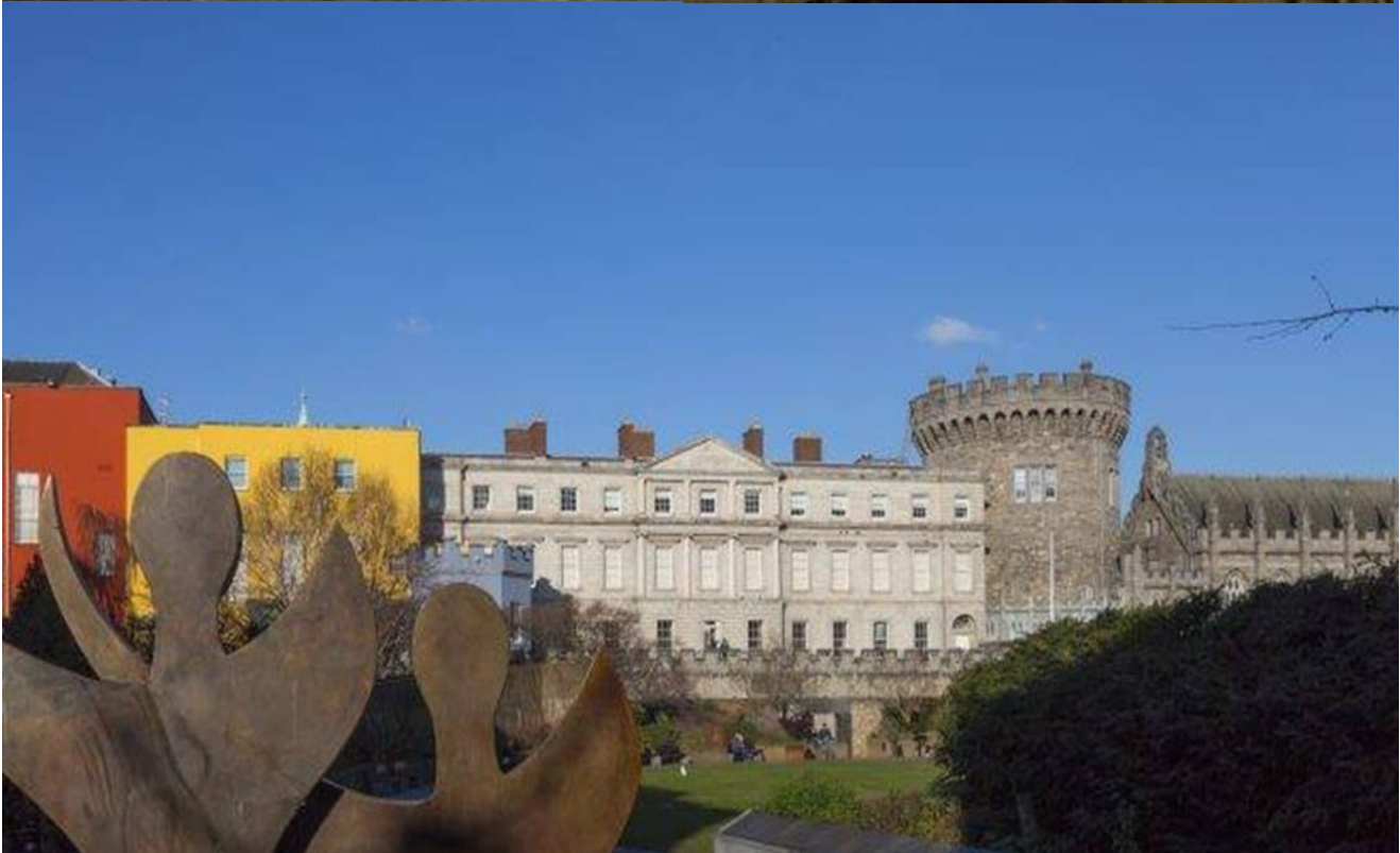
Views of Dubh Linn Gardens, Dublin Castle