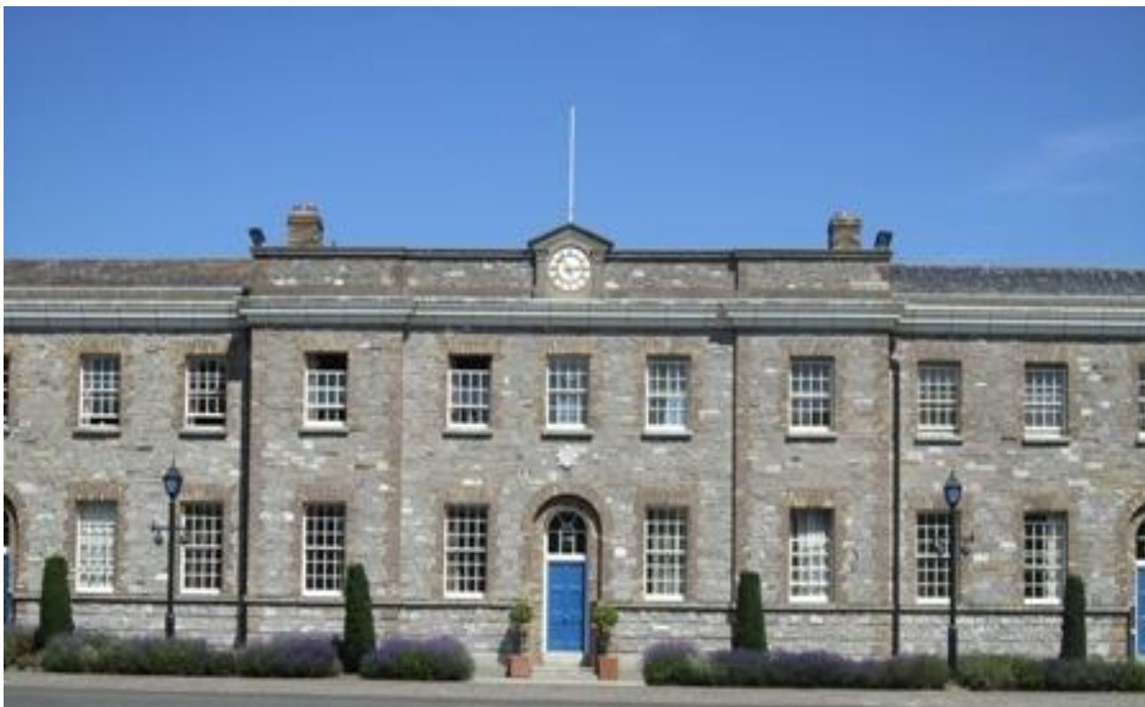
A view of An Garda Síochána Headquarters, Phoenix Park, Dublin