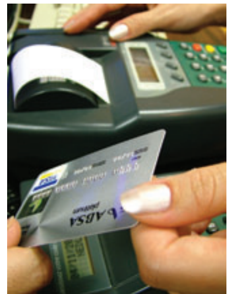
Safety Tips continued on page 6

If out with a group - watch out for one another - safety in numbers.